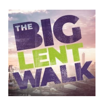
The Big Lent Walk

Thank you for sponsoring the children in doing the Big Lent Walk. We raised £436 for CAFOD! This is fantastic! Thank you so much for your generosity for this great cause.