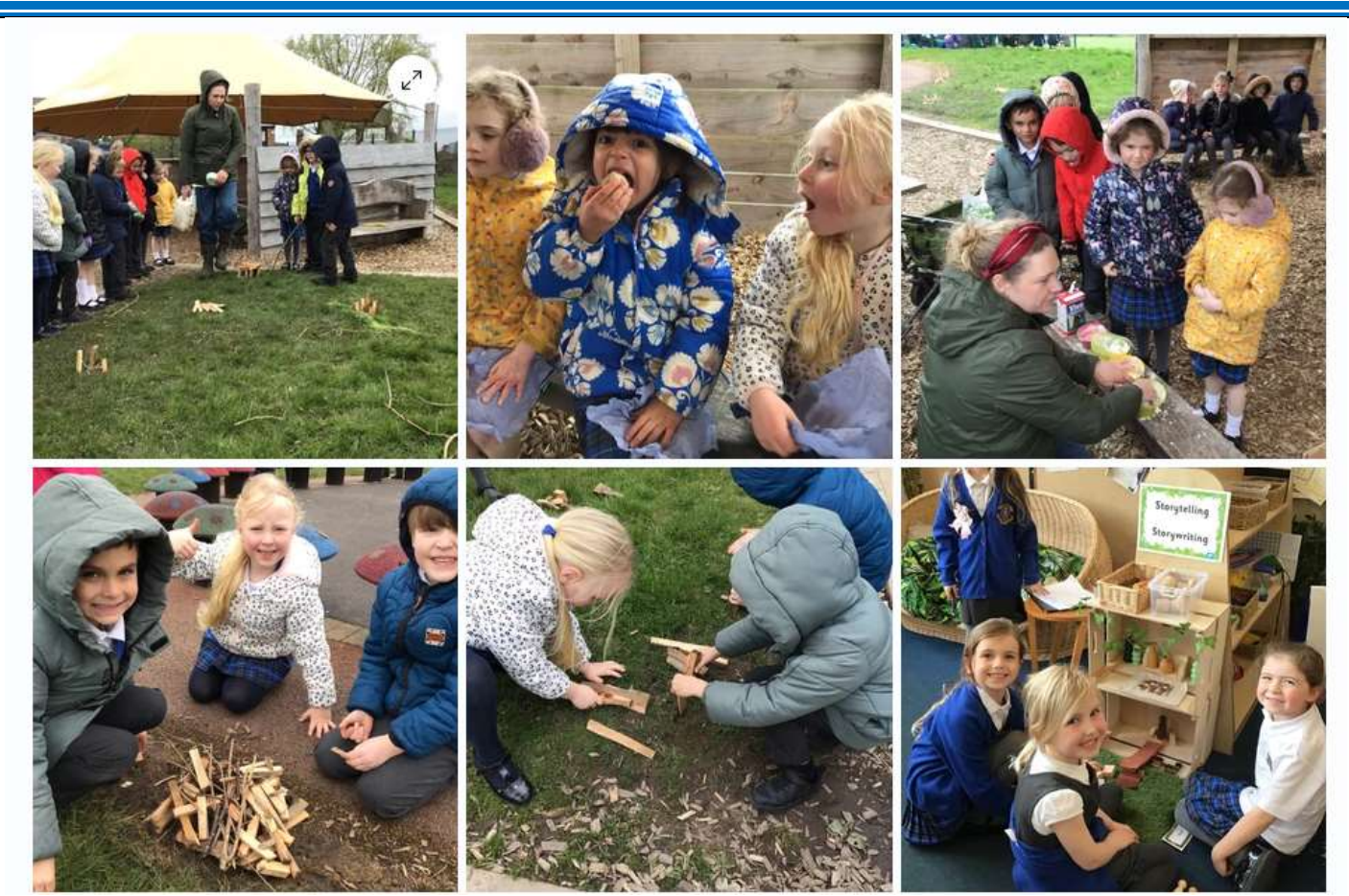
Year 5 at the Great Science Share at Standish High