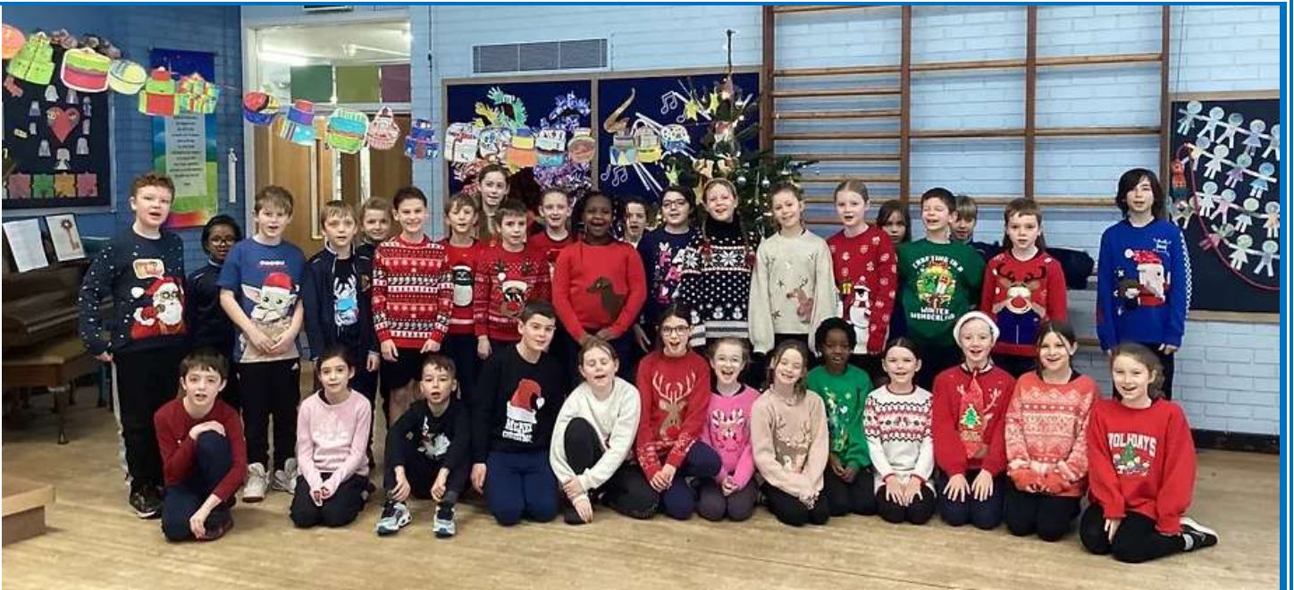
Well done on Wednesday evening at The Edge Year 5! You made us very proud!